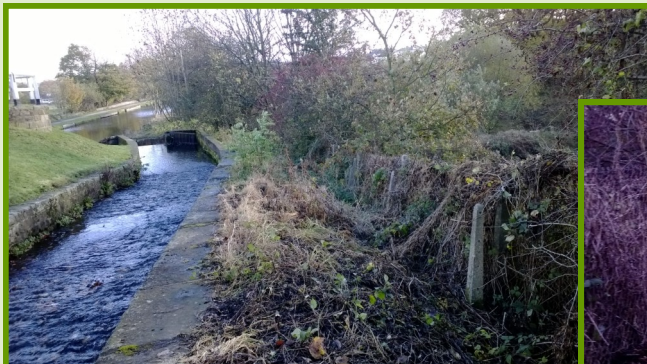
Canalside garden before